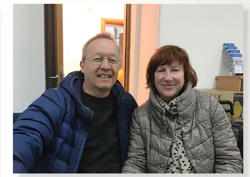
Smiles of Hope

"Those the Lord has rescued will return. They will enter Zion with singing; everlasting joy will Crown their heads. Gladness and joy will overtake them and Sorrow and sighing will flee away". Isaiah 51:11