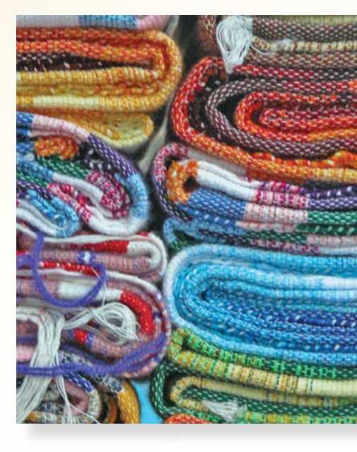
Embellished with love and honor